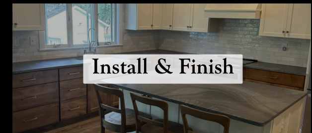
Install & Finish