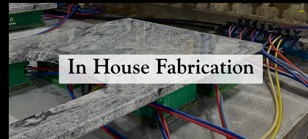
In House Fabrication